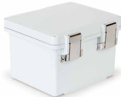
Hinged, Metal Snap Latch (HML)