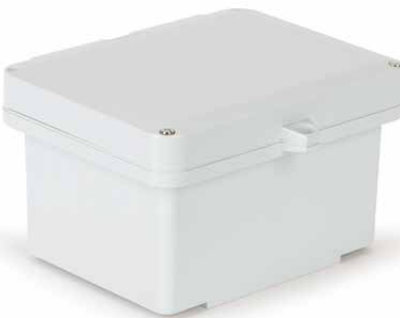
Hinged 2-Screws, Padlock Clamp (HS)