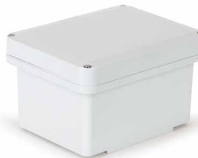
Lift-Off 4-Screws (No Suffix)