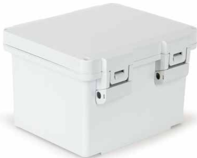
Hinged, Nonmetal Snap Latch (HNL)